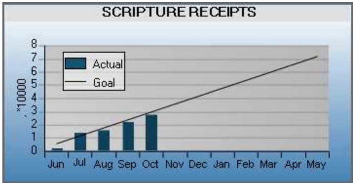
RECEIPTS YTD = $27,931 (39% of annual goal)